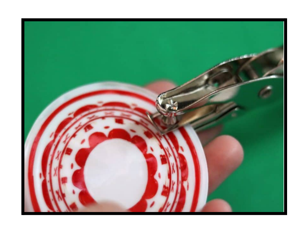
Step 6: Ornament Hanging supplies

You can add extra embellishments if you want. The tik tok I watched added in names and dates since these were kid gifts to their parents! You can totally leave the top part empty and not color it in and then glue on a picture to the front to essentially make a frame! I added some photos- Just cut them out and glued them right on the cup!